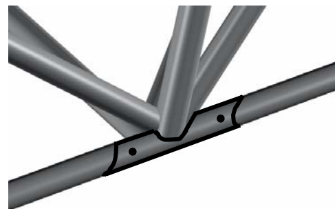
Outside View of Lower Frame Rail