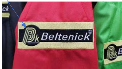
Counterfeit logo with black outline