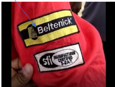
Counterfeit logo with black outline