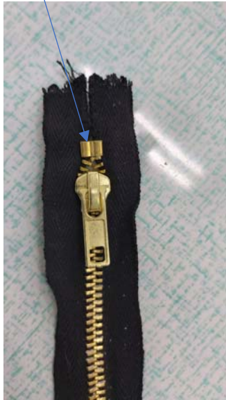
Copper zipper use on genuine suit